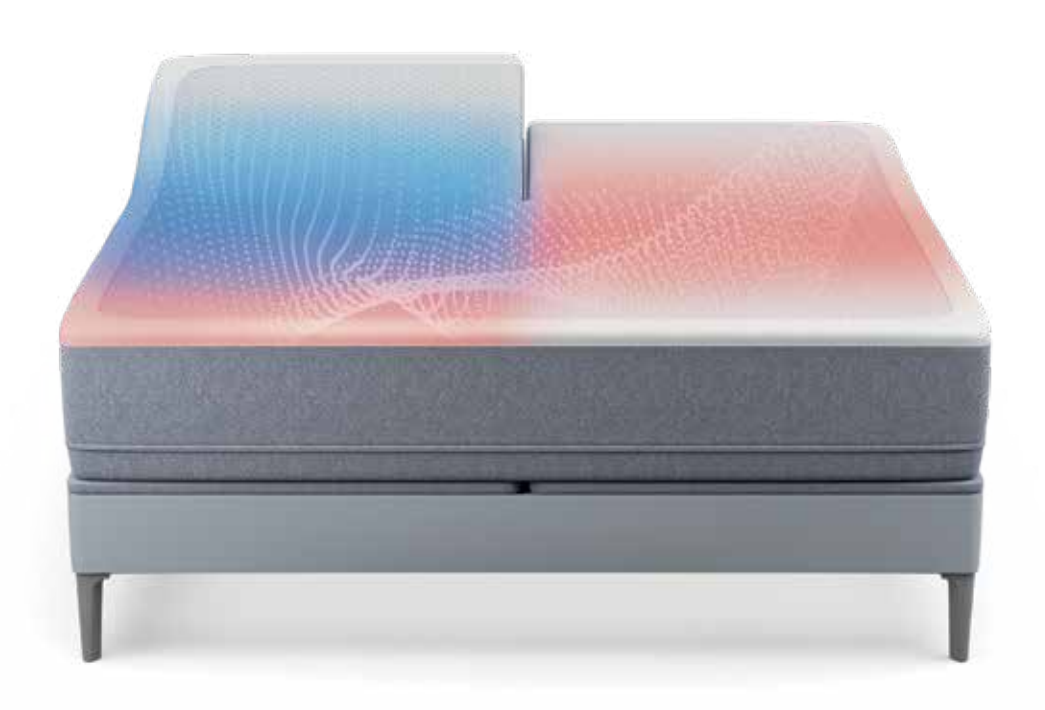
*Based on use of temperature features and our proprietary Responsive Air® technology.

Meet the only smart bed in the world that actively cools, warms and effortlessly responds to each of you.* The Climate360™ smart bed is designed to help you fall asleep faster and help keep you asleep, deeper and longer, through the latest in sleep science, health and research. Temperature is one of the most important factors that can affect your sleep. Your core body temperature works with your circadian rhythm, helping you fall asleep and wake up consistently. Get ready to enjoy more of the restful sleep you need to help you lead a healthy lifestyle.